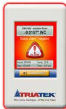
FMS-1655 Surface Mount (Red Safety Halo)