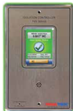
FMS-1655 Flush Mount (Green Safety Halo)